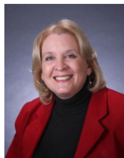
Roberta Fonzi Mayor City of Atascadero